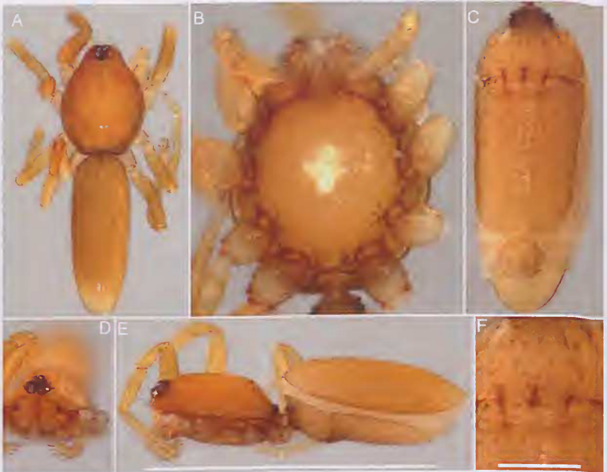
FIG. 2. Cavisternum gillespieae sp. nov., female (allotype PBI_OON 00023655): A, habitus, dorsal view; B, prosoma, ventral view; C, abdomen, ventral view; D, prosoma, anterior view; E, habitus, lateral view; F, female epigyne, ventral view. Scale bars = 1.0 mm (Fig. 4E), 0.1 mm (Fig. 4F).

femur normal size, two or more times as long as trochanter, without posteriorly rounded lateral dilation, attaching to patella basally; patella shorter than femur; cymbium, ovoid in dorsal view, fused with bulb but with clearly defined seam between, not extending beyond distal tip of bulb, covered with plumose setae; bulb pear-shaped, bearing a long thin medially bent, embolus with retrolateral tooth-like projection.